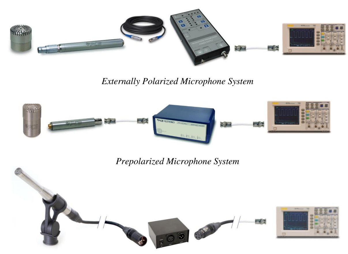
Phantom Powered Microphone System

Phantom powered microphone systems use a 3 pin XLR connector. A phantom powered microphone system should use a 48V phantom power supply or signal conditioner for optimum performance; however these microphone systems may be powered with a 24V or a 12V phantom power supply, but this will limit the maximum output voltage.